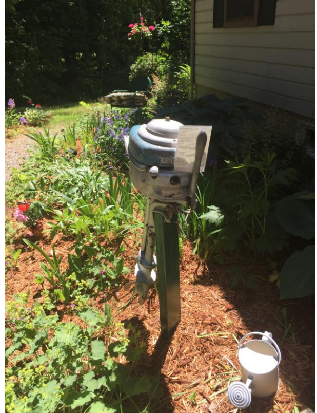
1948 Evinrude Zephyr Outboard motor engine