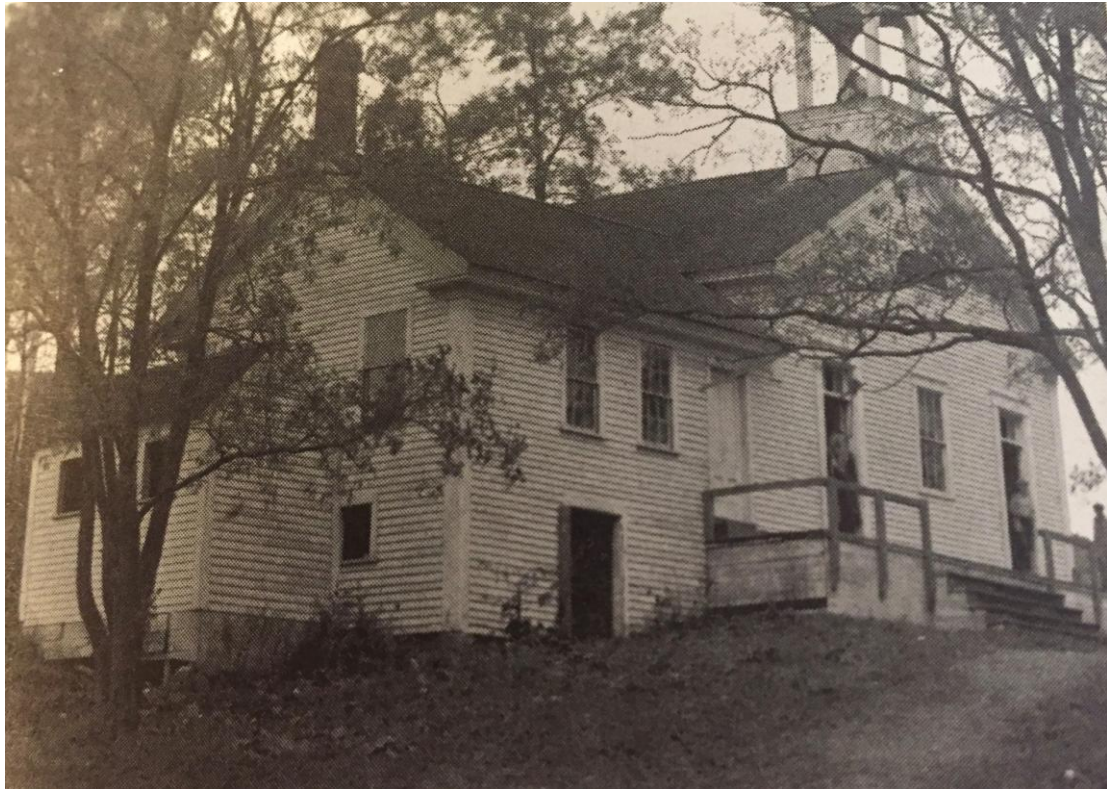
Belgrade's first high school, 1904-1923

high school (see photo). By the time these students entered high school in September 1914, it had become an important part of the town's social life.