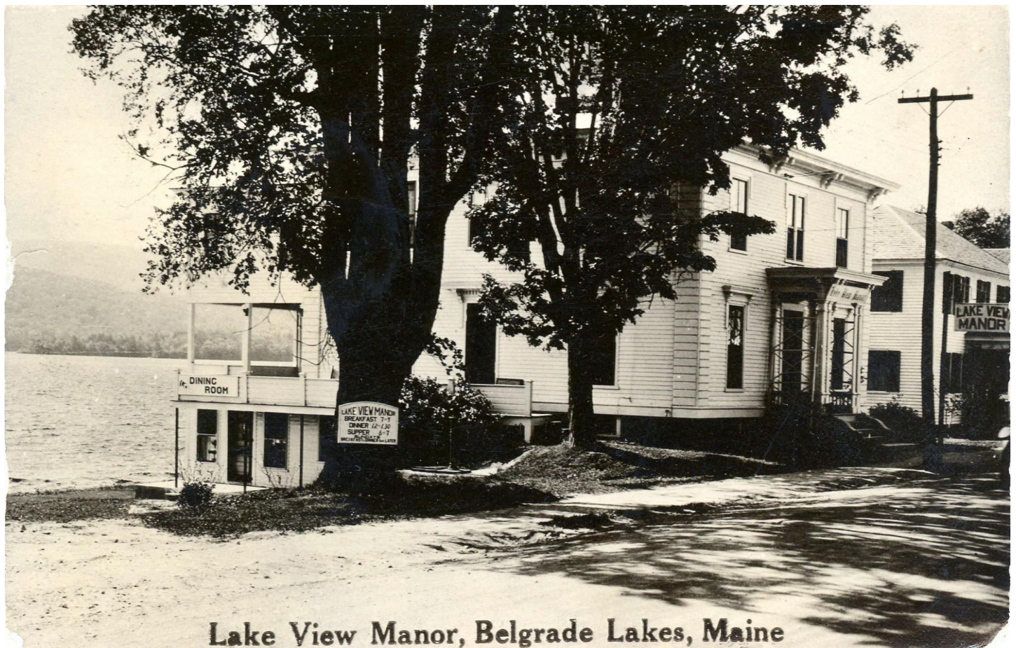
Photo Caption: Photograph of Bean's Lakeview Manor, ca. 1920.

Bean sold all the fishing gear, bait and sports goods tourists wanted, as well as the groceries they needed and the tourist trinkets and souvenirs they desired as mementos of their summer vacations. And for his customers' children, he installed a marble top soda fountain in the back of his store! And he branched out. The first motors to fit on boats appeared in 1910, and soon Bean also was operating a profitable business of renting powerboats on a site near the dam on Mill Stream. The increasing numbers of tourists sparked his entrepreneurial spirit, and he bought the former residence of Henry Golder—the 1843 white house with the distinctive widow's watch on its roof—and operated it as the Lake View Manor guesthouse, complete with a famous dining room where guests could eat breakfast, lunch and dinner while looking out at Long Pond (see photo and ad below). He also acquired the white house next to it—currently the home of Balloons n' Things gift shop—which became The Cottage annex to the Lake View Manor.