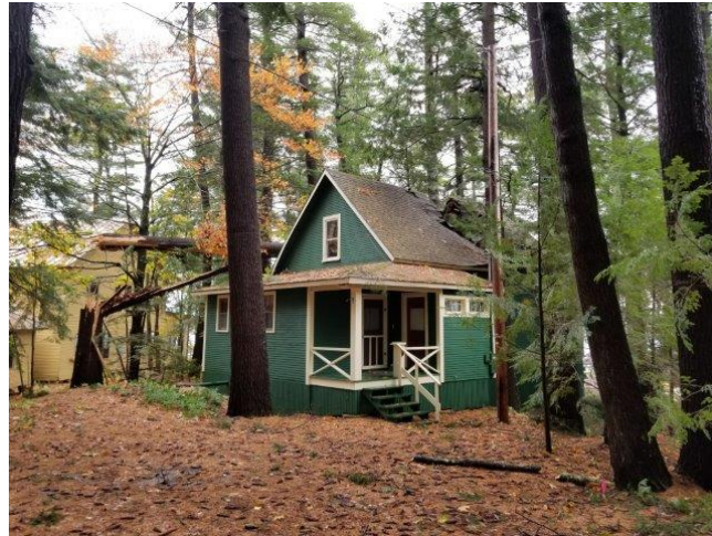
Picture of storm damage above