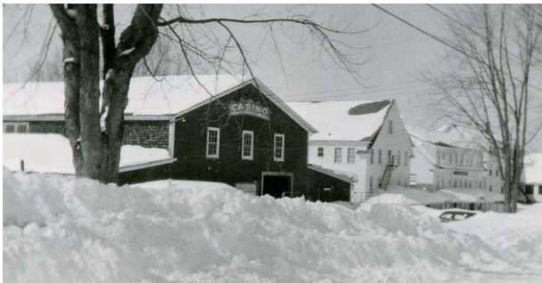
Casino and Lakeshore Hotel in Winter, ca. 1950

Belgrade Lakes after Jan. 1950 snow storm. Possibly 1949 or 1951. If any members remember the exact year, please respond. Note that old Casino with movie screen and bowling alley was still in town on the spot now occupied by Carter's Boat Storage.