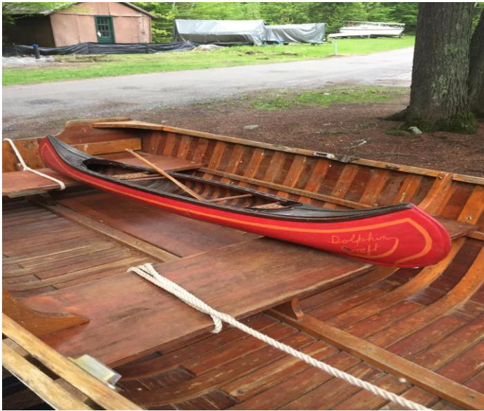
Photo 2 & 3: Hand-made model canoe, made by AC Roy, ca. 1925, resting inside full-size cedar bark boat.

The model canoe and a half-boat wall plaque with the date 1916 on it have been placed in our large display cases in the BHS History Room in the Belgrade Center for All Seasons. The History Room is open from 10 am to 2 pm on Tuesdays, Wednesdays and Thursdays during the summer, so please drop in to view these unique treasures. The wooden fishing boat is in excellent condition, considering that it is at least 75 years old, and we are planning to put it on a trailer and exhibit it in the annual 4 th of July parade.