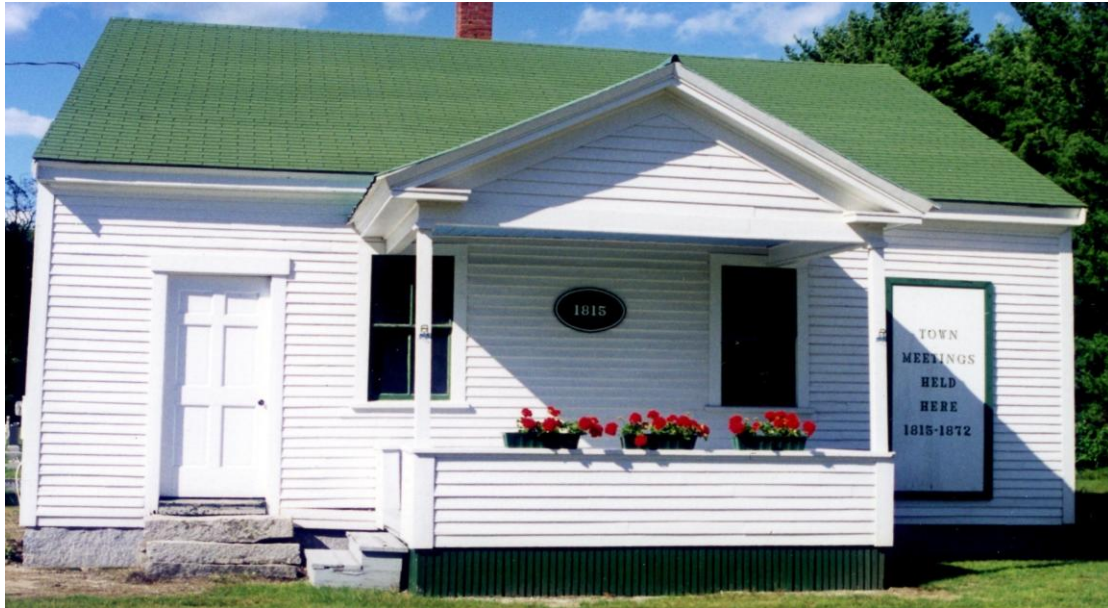
Belgrade's 1814 Old Town Meeting House (Note: The porch is an early 20 th century addition.)

process of applying for grants from foundations that give to community projects, and we are hopeful that being included in Maine Preservation's List of Most Endangered Historic Sites will assist our efforts to secure one or two such grants. If members are aware of foundations that are supportive of historic preservation projects, please let us know about them!